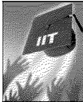
REBELS AGAINST HRD MINISTRY

While the senate has the powers to control and regulate standards of instruction, education and examinations and can pass ordinances, the institute's board of governors can modify or cancel ordinances.